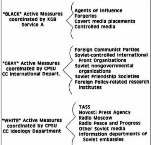
From: Soviet Active Measures in the Post Cold War Era 1988-1991